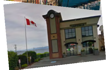
Photos from top to bottom: Ladysmith, Qualicum Beach, Parksville, French Creek, Nanaimo, Lantzville.